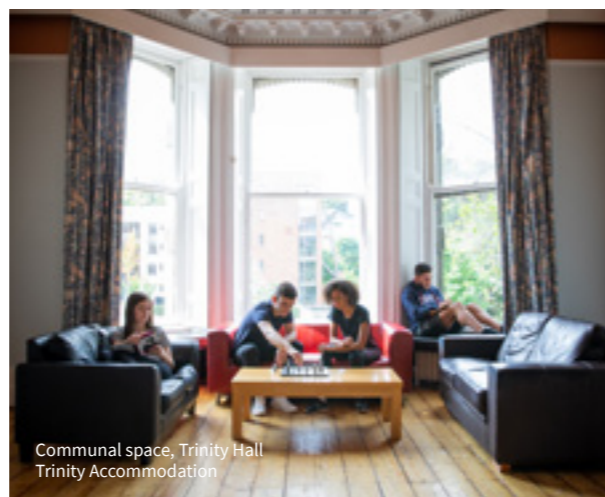
Communal space, Trinity Hall Trinity Accommodation

Applications for all Trinity accommodation are made online. In order to apply, you must have your Trinity ID number. After you have officially accepted your place, your application number becomes your student number. If you would like Trinity accommodation, you are advised to apply as early as possible: www.tcd.ie/accommodation