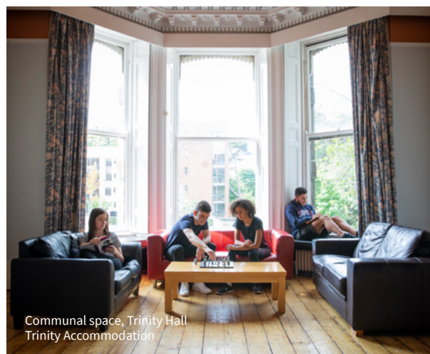
Communal space, Trinity Hall Trinity Accommodation

Applications for all Trinity accommodation are made online. In order to apply, you must have your Trinity ID number. After you have officially accepted your place, your application number becomes your student number. If you would like Trinity accommodation, you are advised to apply as early as possible: www.tcd.ie/accommodation